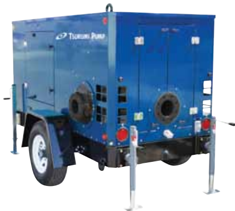
Sound Attenuated Priming Assisted: EPT4-Q