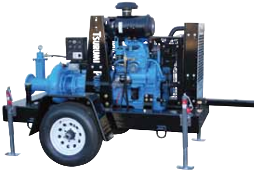
Priming Assisted: EPT4-150